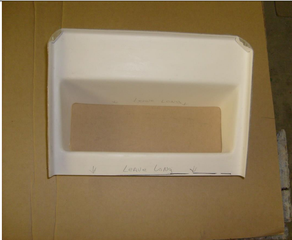
Part no SA384280, Adapter air box early. To be used on Selkirk Aviation's category 4 cowling, $250.