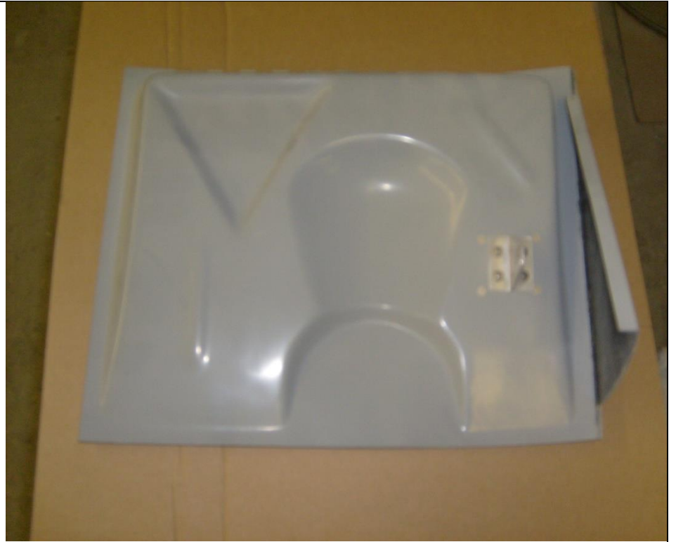
**Part no. SA382600, Right cowl flap assembly, categories 2 and 3, $695.(Left cowl flap SA382500 also available and not shown.)