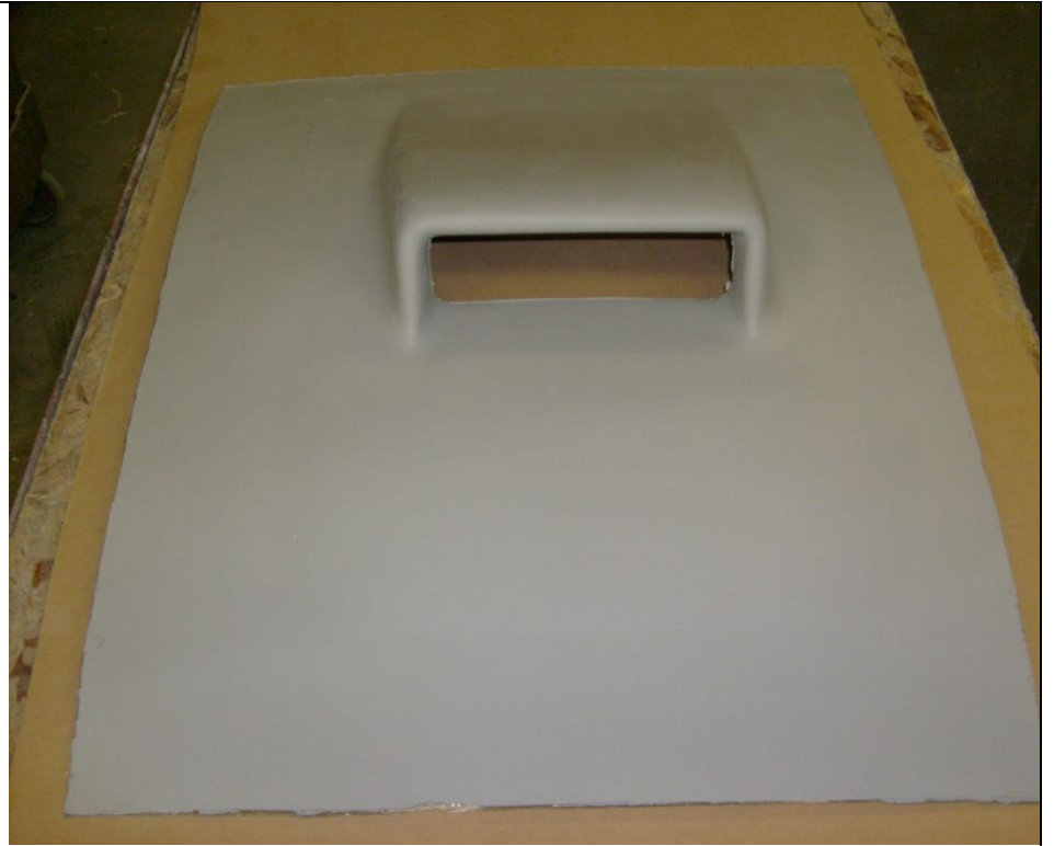
**Part no. SA383230, Nose scoop air intake, categories 1 and 3, $487.