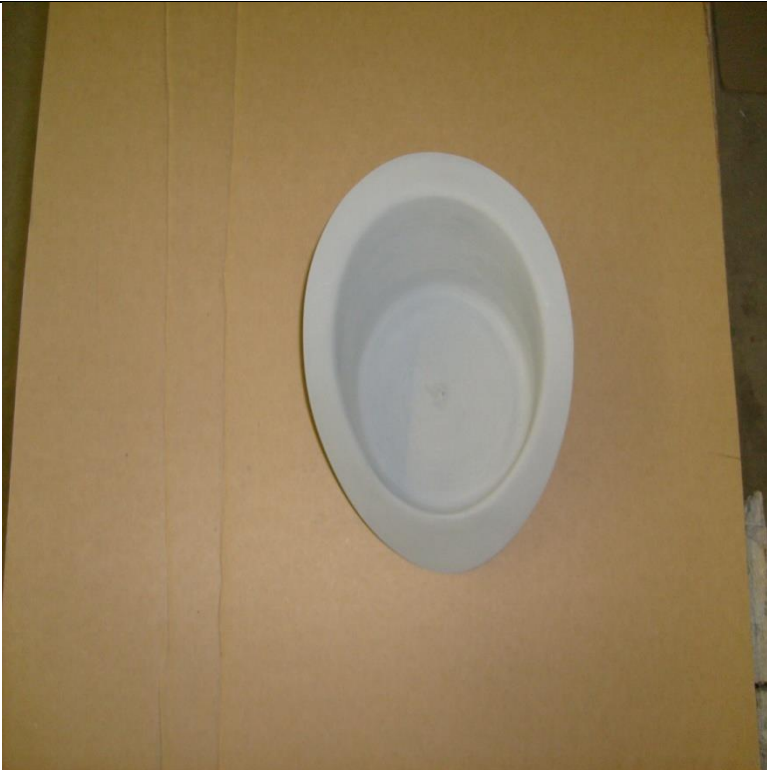
**Part No. SA384260, light can housing, category 4, $175.