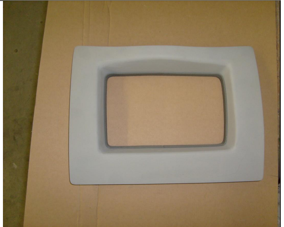
**Part No. SA384270, filter box speed fairing, category 4, $225