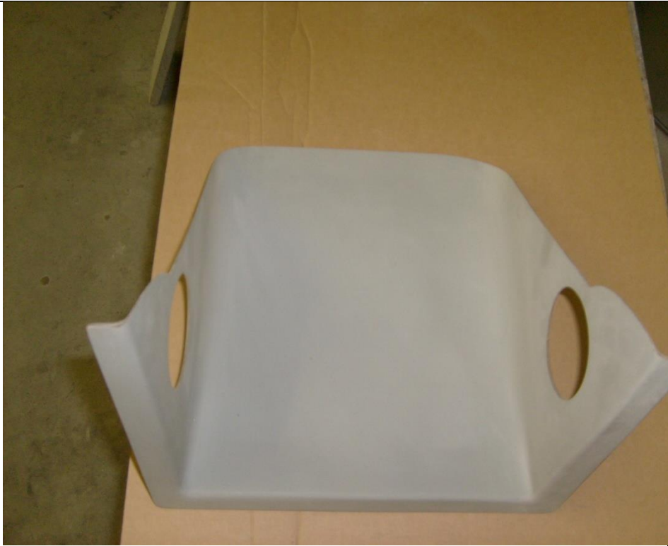
**Part no. SA382230, Tunnel air intake, Category 2, $348.