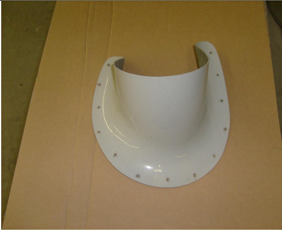
**Part no. SA384272, Speed exhaust fairing, all categories, $275