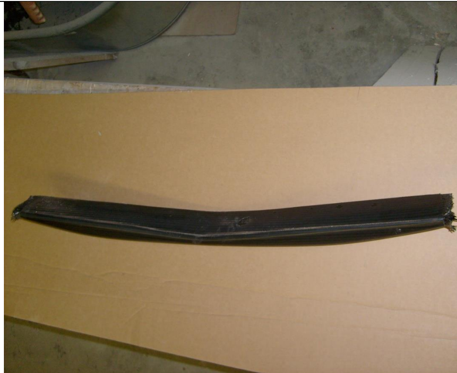
**Part no. SA382241, composite support cowl flap, categories 2 and 3, $244.