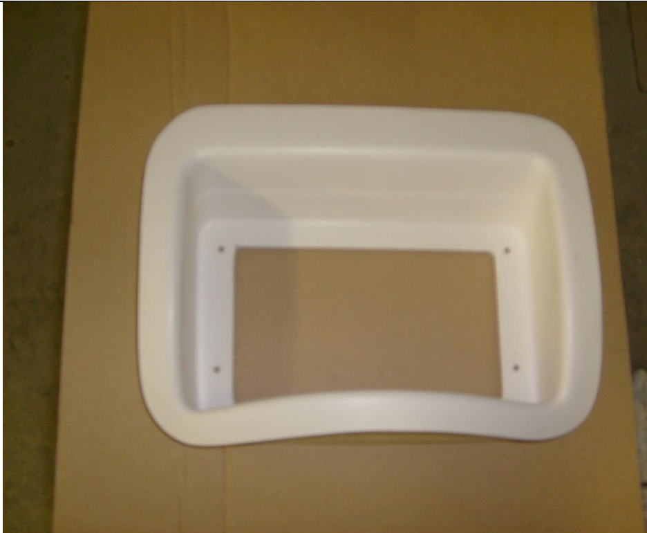
**Part no.SA384230, air filter box, category 4, $475.