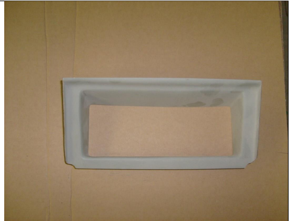
Part no. SA384278, Adapter air box late. To be used on Selkirk Aviation's category 4 cowling, $275.