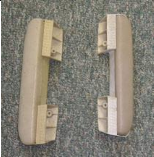
Arm Rests – Limited Quantity