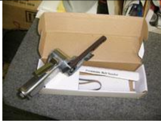
Hand held sander perfect for installing fiberglass parts. $39