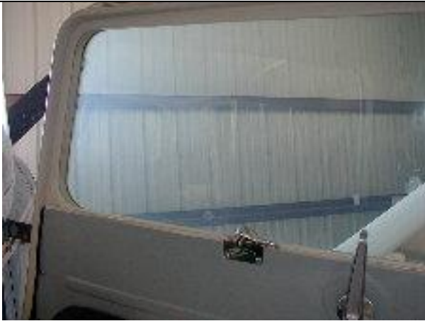
White u-channel window trim shown here. Also available in black.