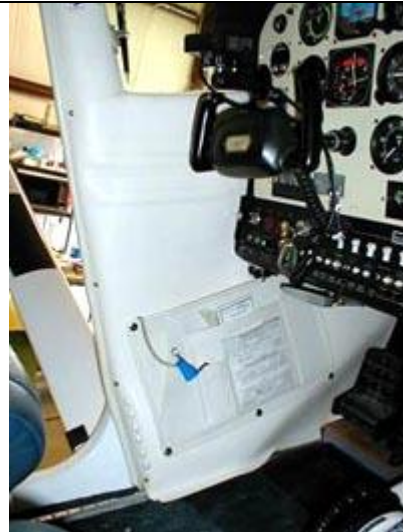
Vinyl Creme Pocket shown. Also Package 2 pockets with 20 feet of 1/4" or 1/2" round lacing for door jamb available.