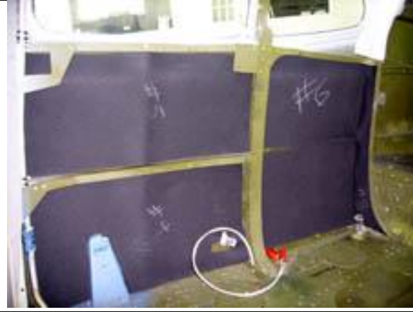
These 2 pictures show a bare side wall of aircraft (L) and (R) the after photo of the 1/2" black closed cell rubber soundproofing installed. We recommend a spray-on 3M adhesive and touch of contact cement. We provide a burn test for all rubber soundproofing sold. We sell ceiling and extended bag rubber soundproofing kits for many Cessna 170-206 aircraft. 1/4" rubber also available.