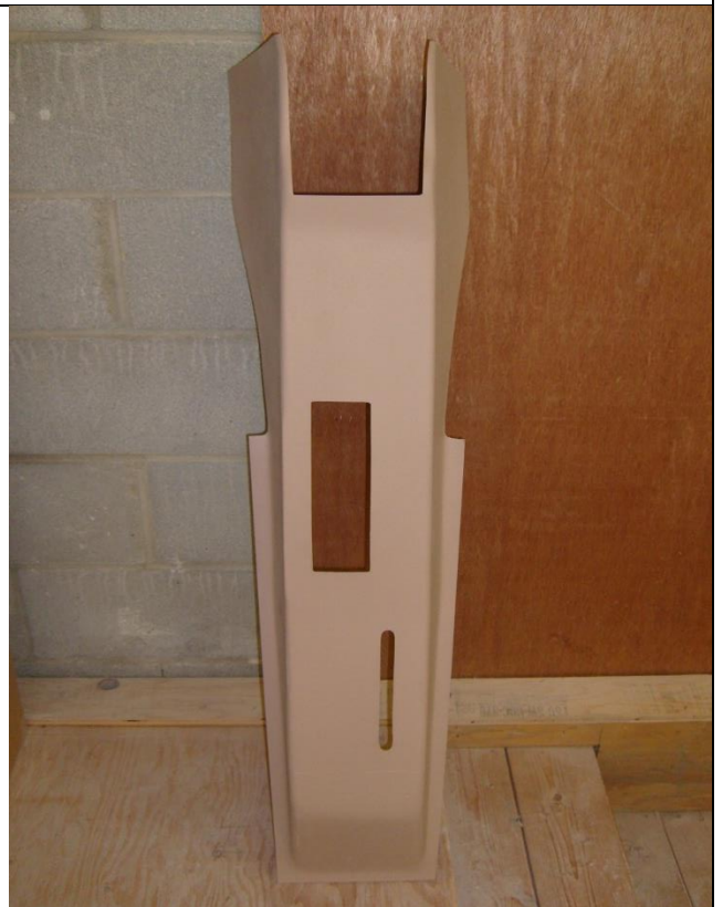
Flap tunnel cover shown on the shelf. This will fit all Cessna 170-185 aircraft. Shown in mocha color.