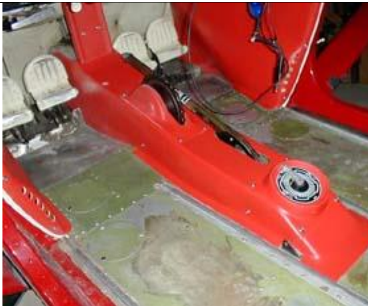
Flap tunnel cover with round fuel selector cover for early C170, 172, 175 and 180 models. Note elevator trim control wheel cover and yoke control shield cover.