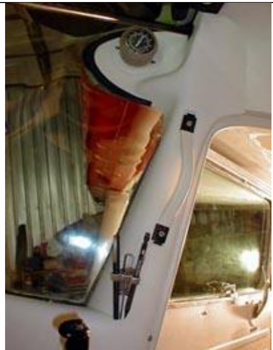
Right side front door post SA55-02 for late style C180/185