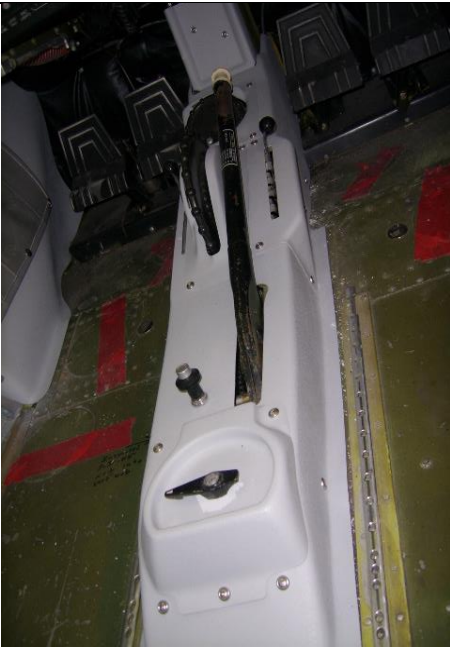
Flap tunnel cover with late style SA55-22 fuel selector cover, cowl flap handle cover SA55-26, trim control wheel cover SA55-20 and yoke control shield SA55-23.