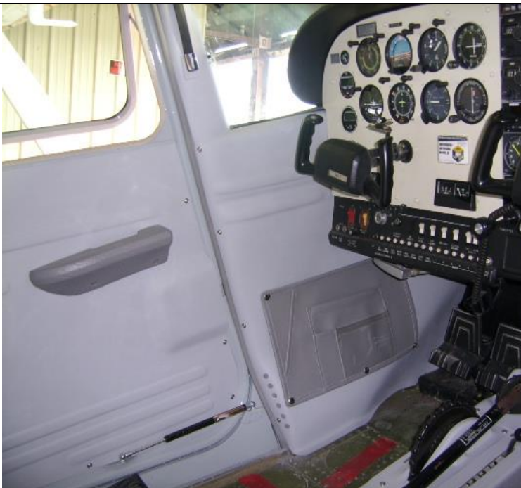
Left side of front of Cessna 180, early 182 aircraft.