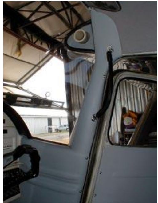
Front door post SA55-02 for early style Cessna 170, 172, 180, and 182 aircraft. The hand hold strap is secured in with screws.