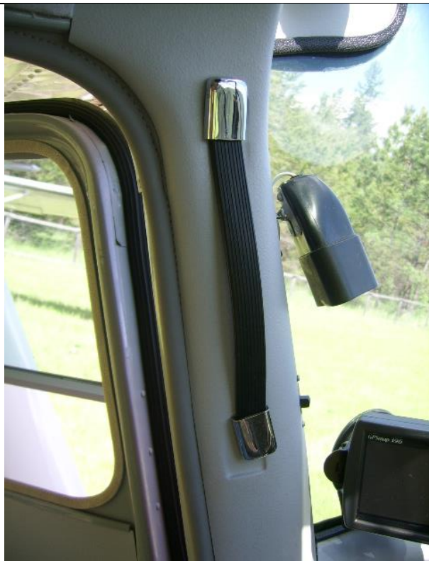
Factory hand hold strap. Note indentions in front door post.