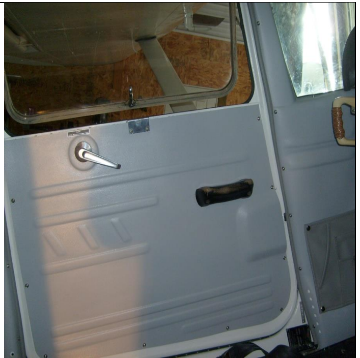
Left side door panel part no. SA55-05. Note design pattern.