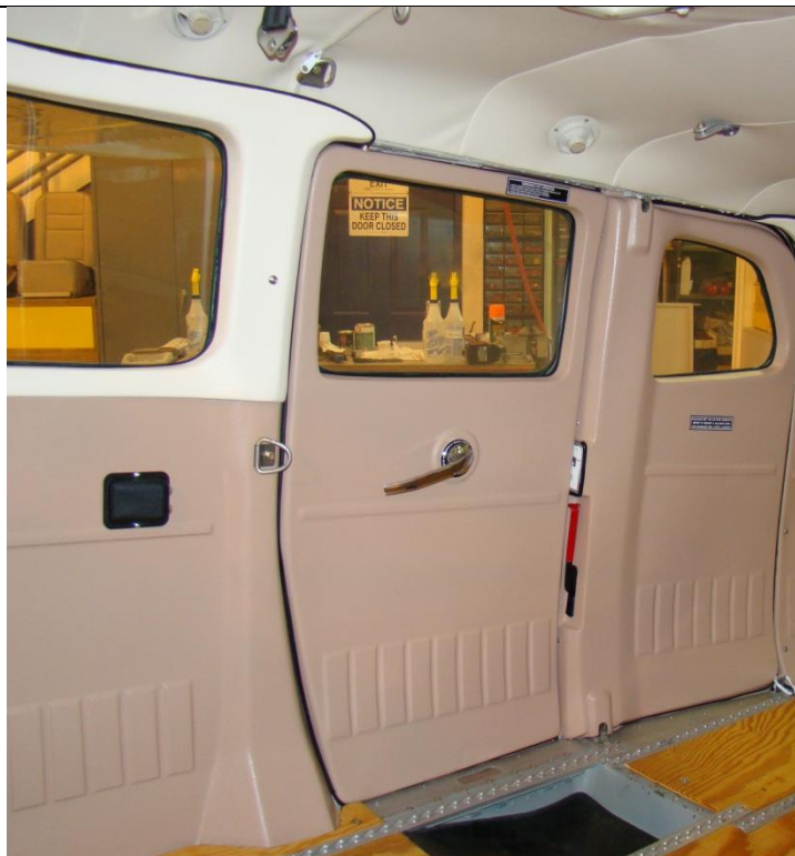
This is a right side view of the Cessna 206.