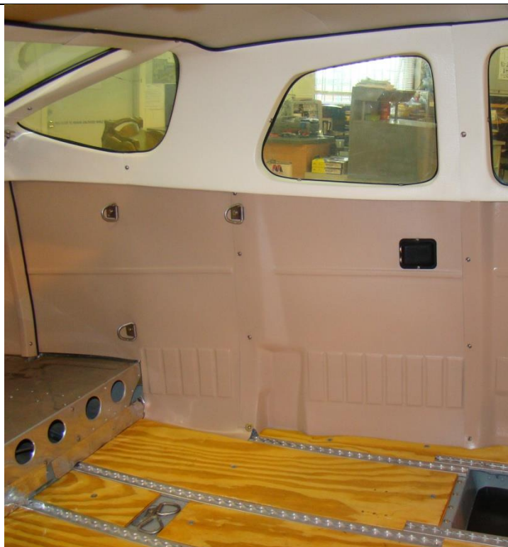
This is left side view of the Cessna 206.