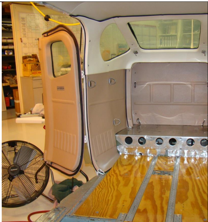
This is a rear view of the Cessna 206 Note rubber u-channel trim around all window fairings which touch the glass.