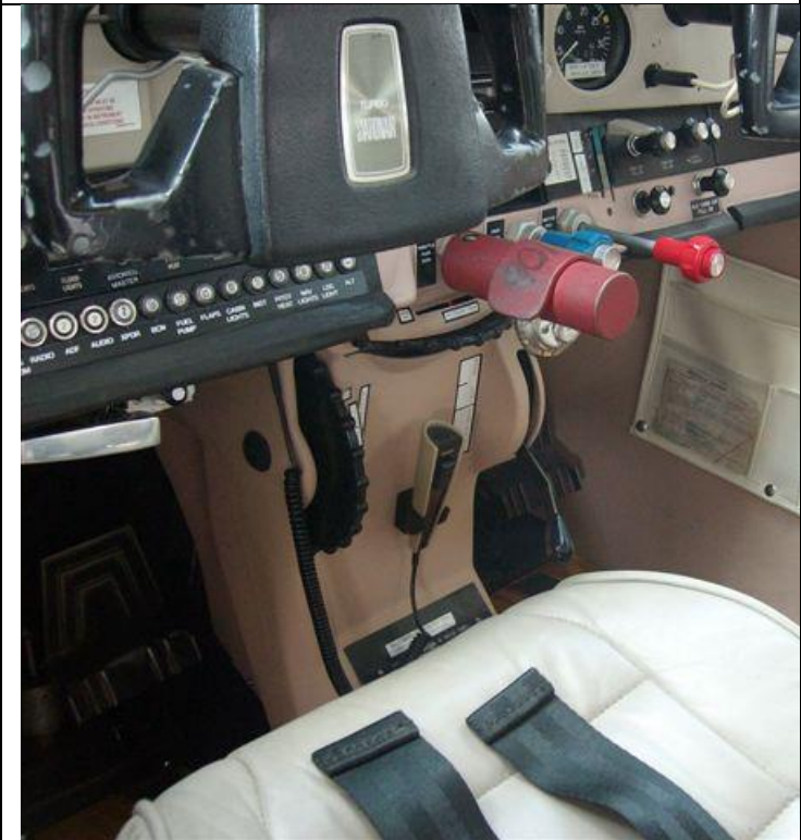
Front section of Cessna 206 shown in mocha with an ivory right side pocket.