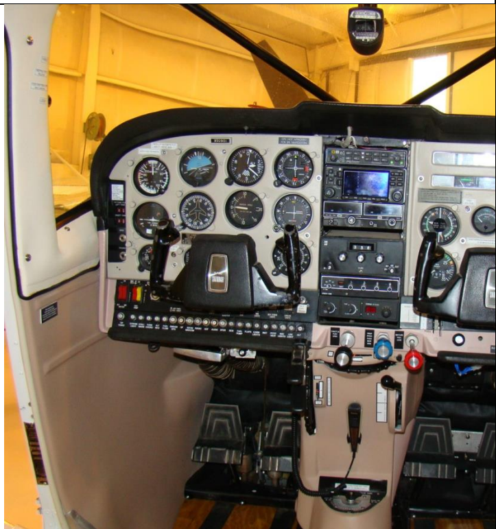
Front view of the Cessna 206.