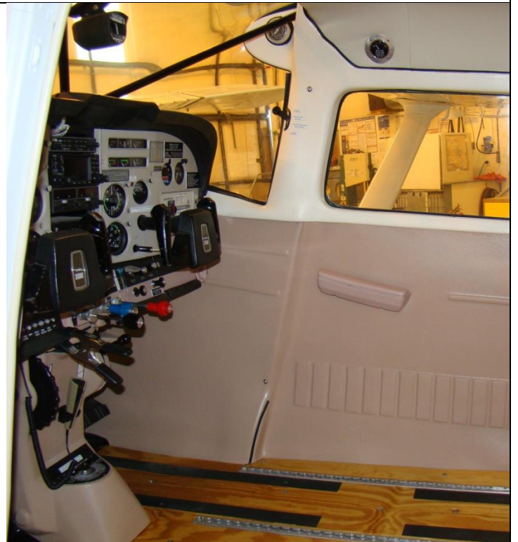
Right side front door post part no. SA58-02 shown in ivory and lower co-pilot panel part no. SA58-06 shown in mocha.