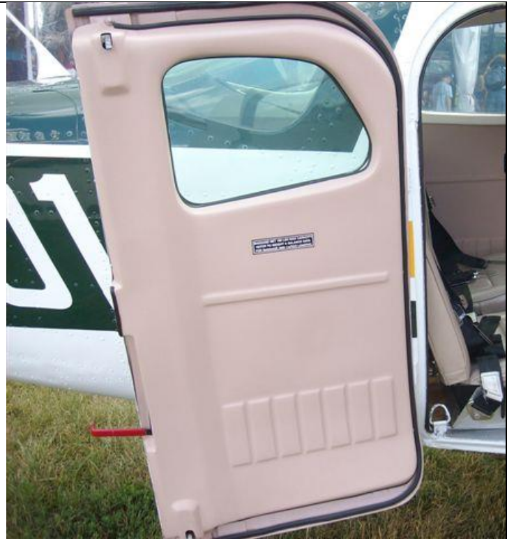
This rear cargo door part no. SA58-10 is shown in mocha.