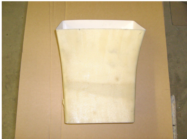
Bottom photo SA384230, air filter box, category 4. $510.